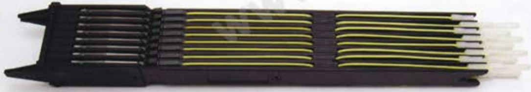
M2 电磁阀 Electromagnet valves assembly